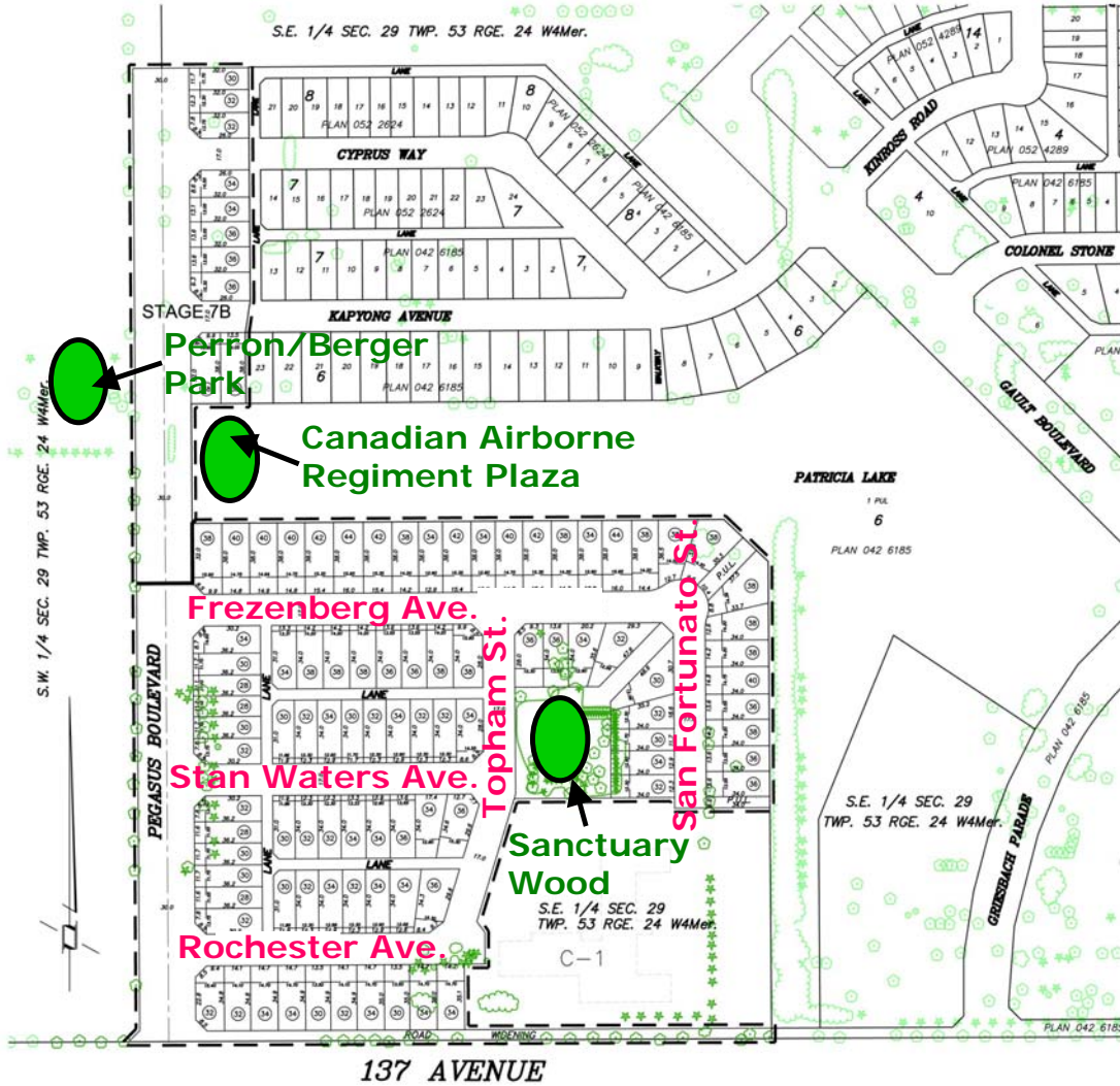
Plan 2: Proposed Stage 7 Names