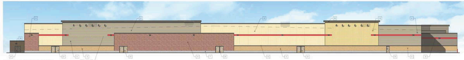
4 NORTH ELEVATION SCALE: 1:200 (SEE ELEVATION 1 ABOVE FOR ADDITIONAL NOTES)