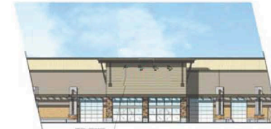
3 ENTRY ELEVATION SCALE: 1:200