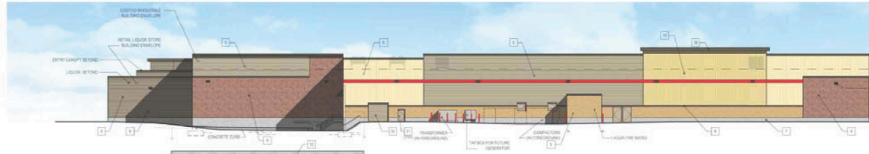
5 EAST ELEVATION SCALE: 1:200 (SEE ELEVATION 1 ABOVE FOR ADDITIONAL NOTES)

ADDRESS 1234567890 SCALE: 1:100 (SUPPLIED AND INSTALLED BY M.B.S.) 1008