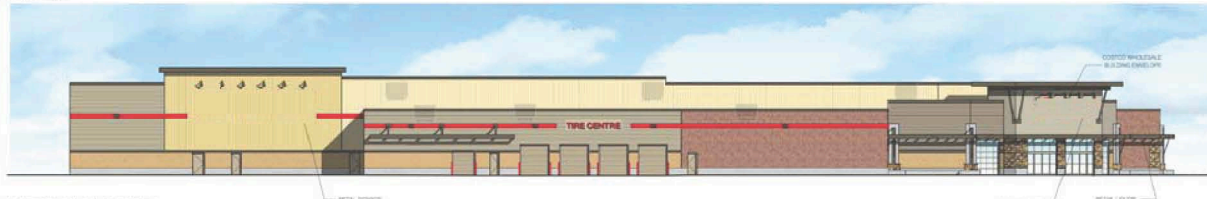
2 WEST ELEVATION SCALE: 1:200 (SEE ELEVATION 1 ABOVE FOR ADDITIONAL NOTES)