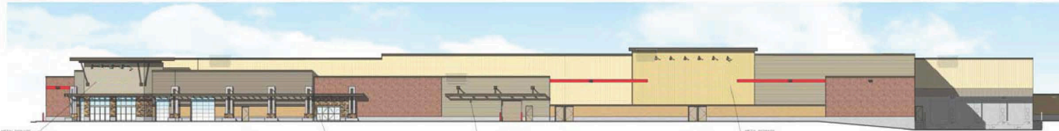
1 SOUTH ELEVATION SCALE: 1:200