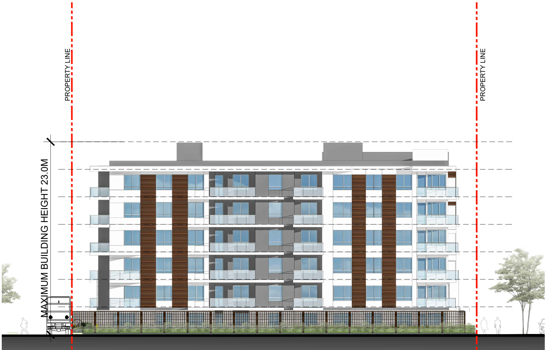
Appendix 4- North Elevation