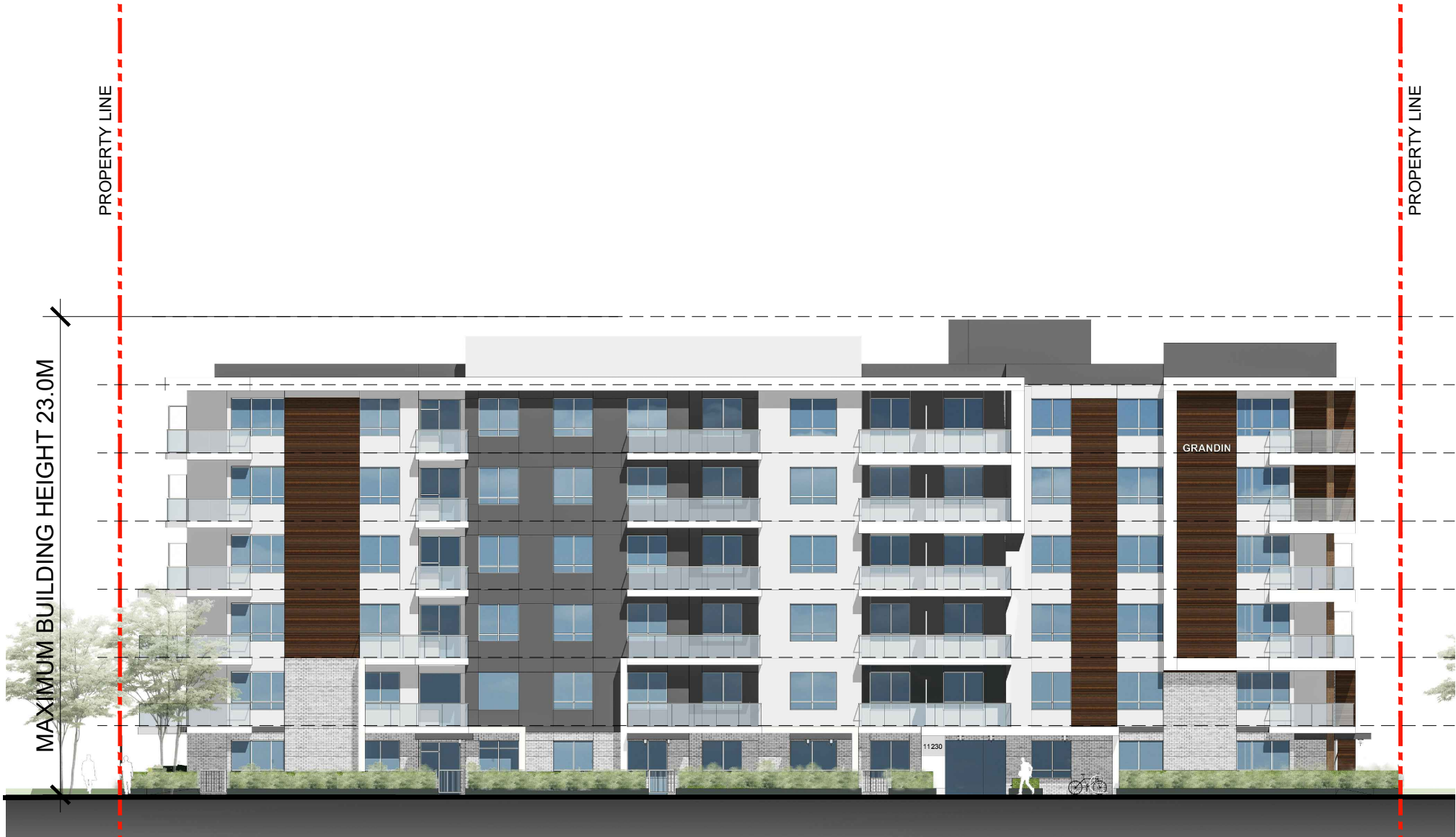
Appendix 2- West Elevation