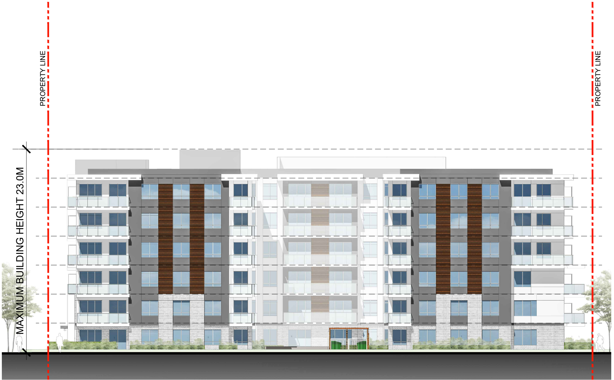
Appendix 3- East Elevation