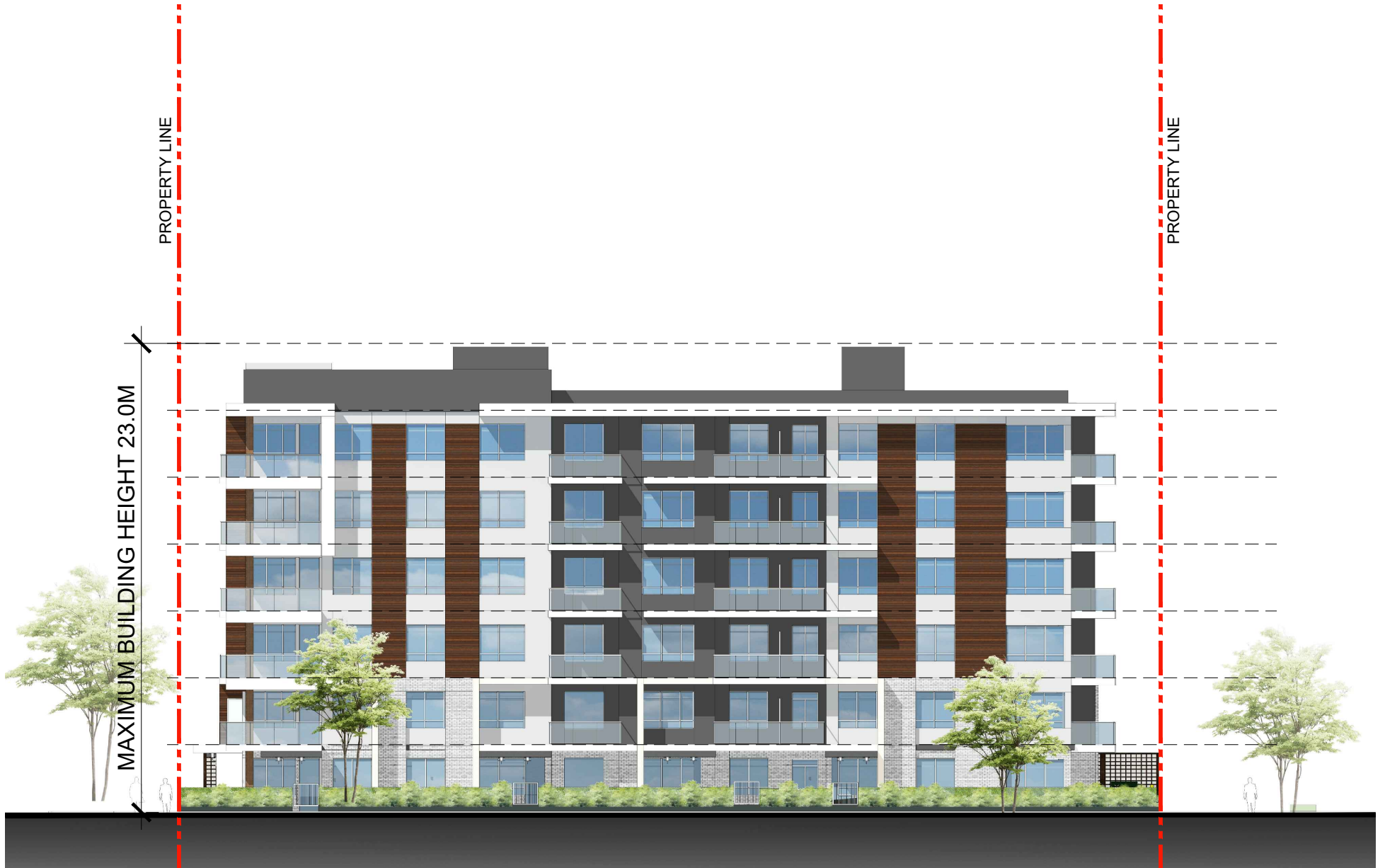
Appendix 5- South Elevation