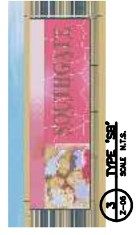
3 TYPE 'SB' SCALE N.T.S.