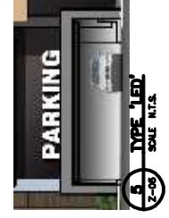
5 TYPE 'LED' SCALE N.T.S.