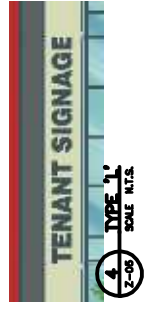
4 TYPE 'L' SCALE N.T.S.