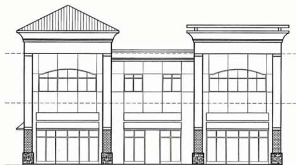
WEST ( 34 ST )