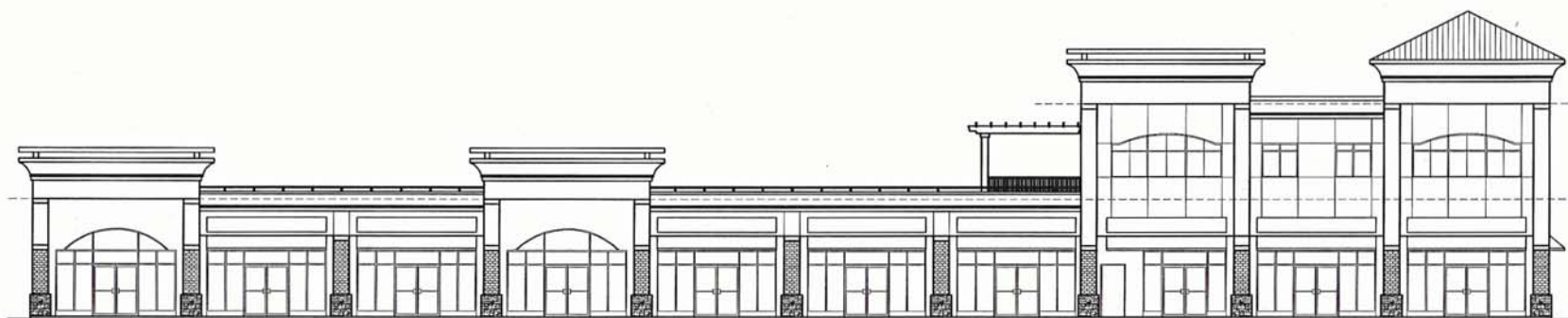
NORTH ( 28A AV )