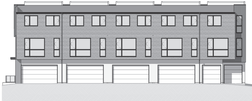
② North Building East Elevation 1/16" = 1'-0"