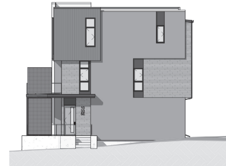
④ North Building South Elevation 1/16" = 1'-0"

CANTIRO - Groat Estates North Building Elevations 10335-10321 Wadhurst RD NW Edmonton AB Design Development - 2021 11 15