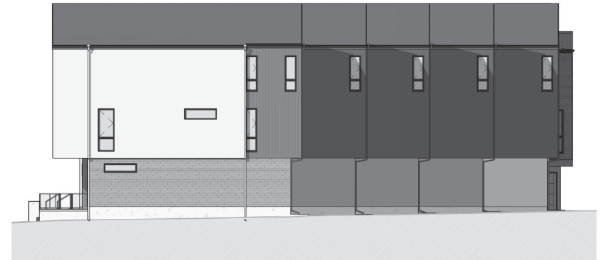
④ South Building South Elevation 1/16" = 1'-0"

CANTIRO - Groat Estates South Building Elevations 10335-10321 Wadhurst RD NW Edmonton AB Design Development - 2021 11 15