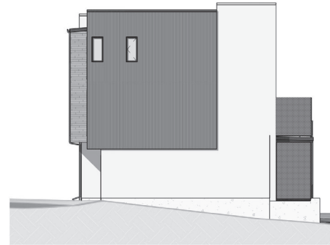
③ North Building North Elevation 1/16" = 1'-0"