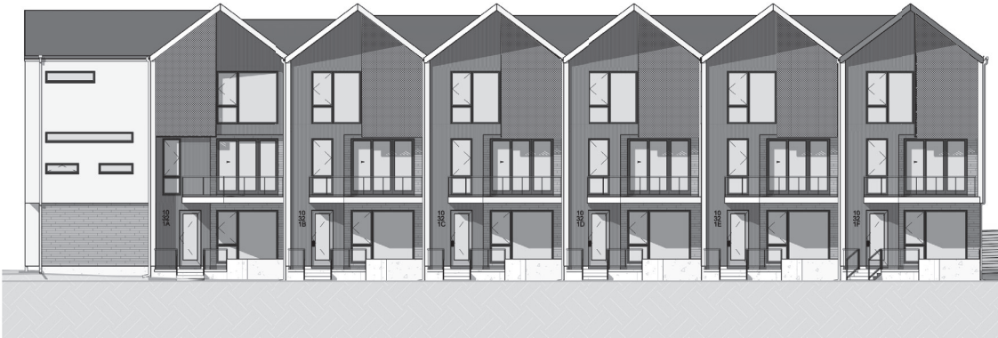
① South Building West Elevation 1/16" = 1'-0"