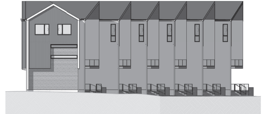
③ South Building North Elevation 1/16" = 1'-0"