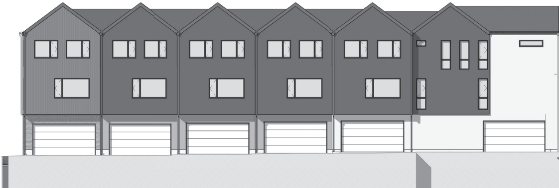
② South Building East Elevation 1/16" = 1'-0"