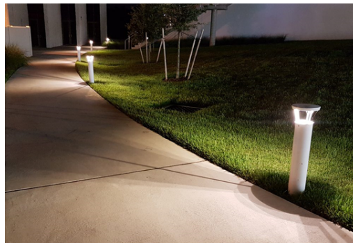
Figure 1: Example of pedestrian-scale lighting.