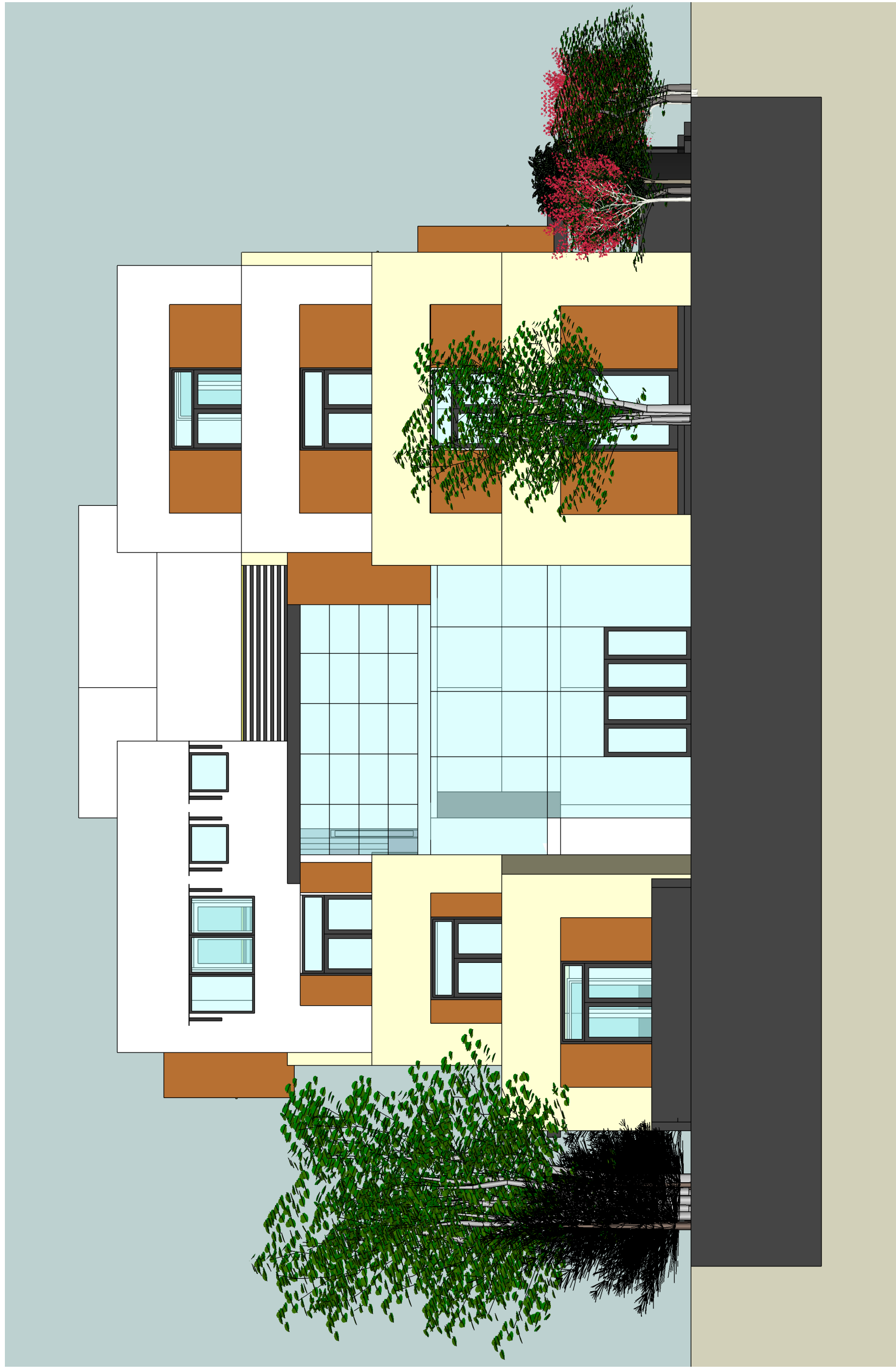
SOUTH ELEVATIONS Scale: 1/8" = 1'