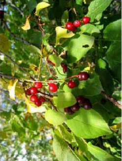
PIN CHERRY TREE