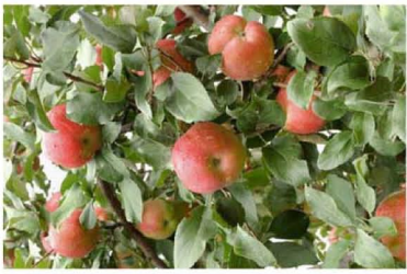
HONEYCRISP APPLE TREE