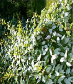
HARDY KIW VINE