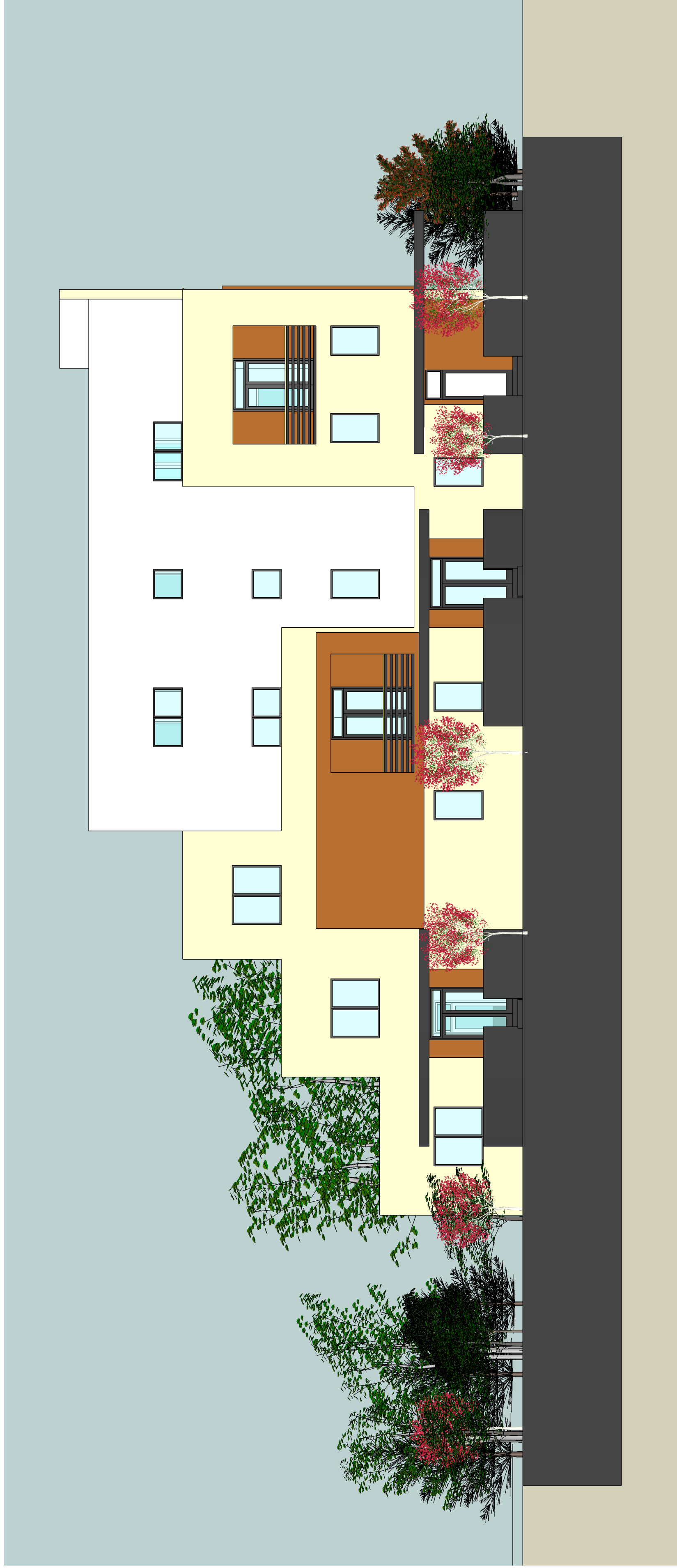
WEST ELEVATION Scale: 1/8" = 1'