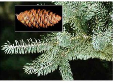
WHITE SPRUCE TREE