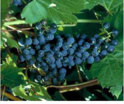
ST. CROIX GRAPE VINE