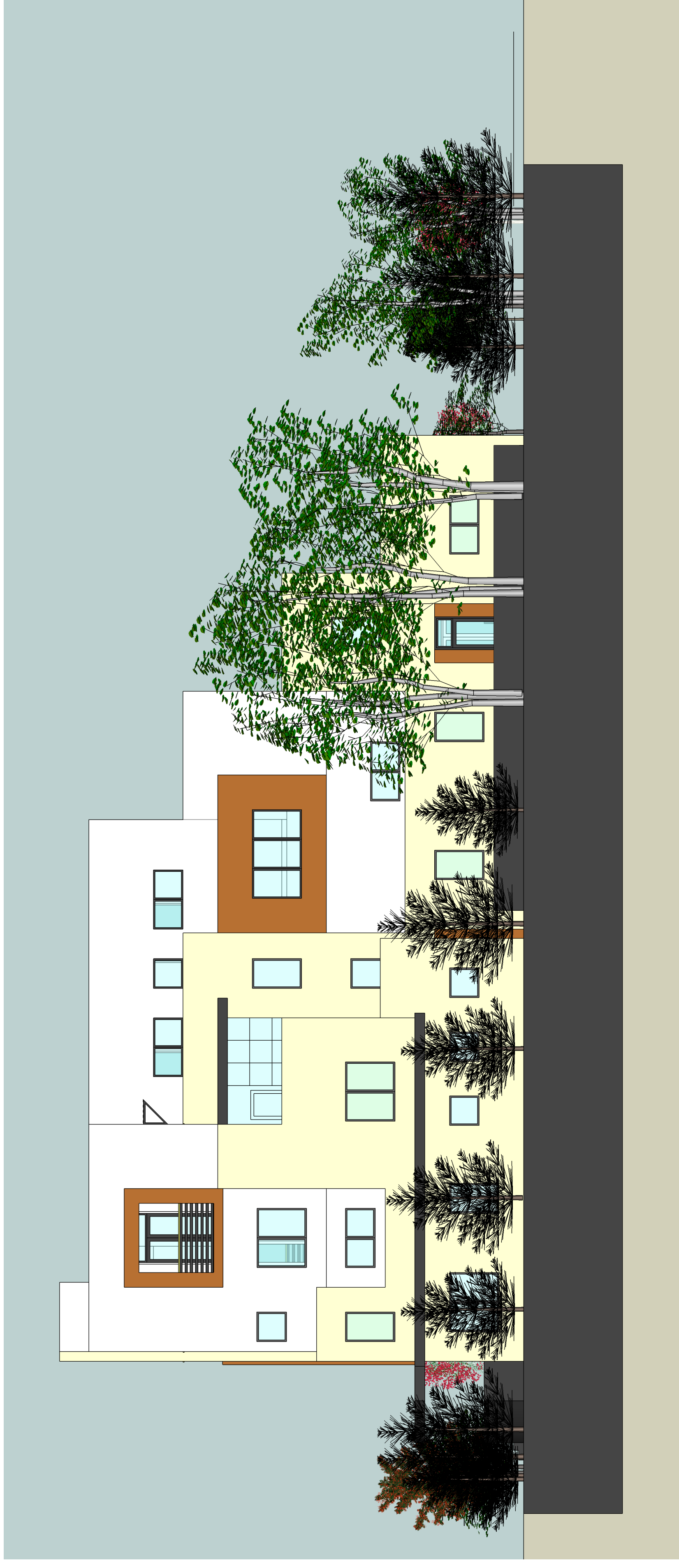
EAST ELEVATIONS Scale: 1/8" = 1'