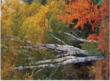
PAPER BIRCH TREE