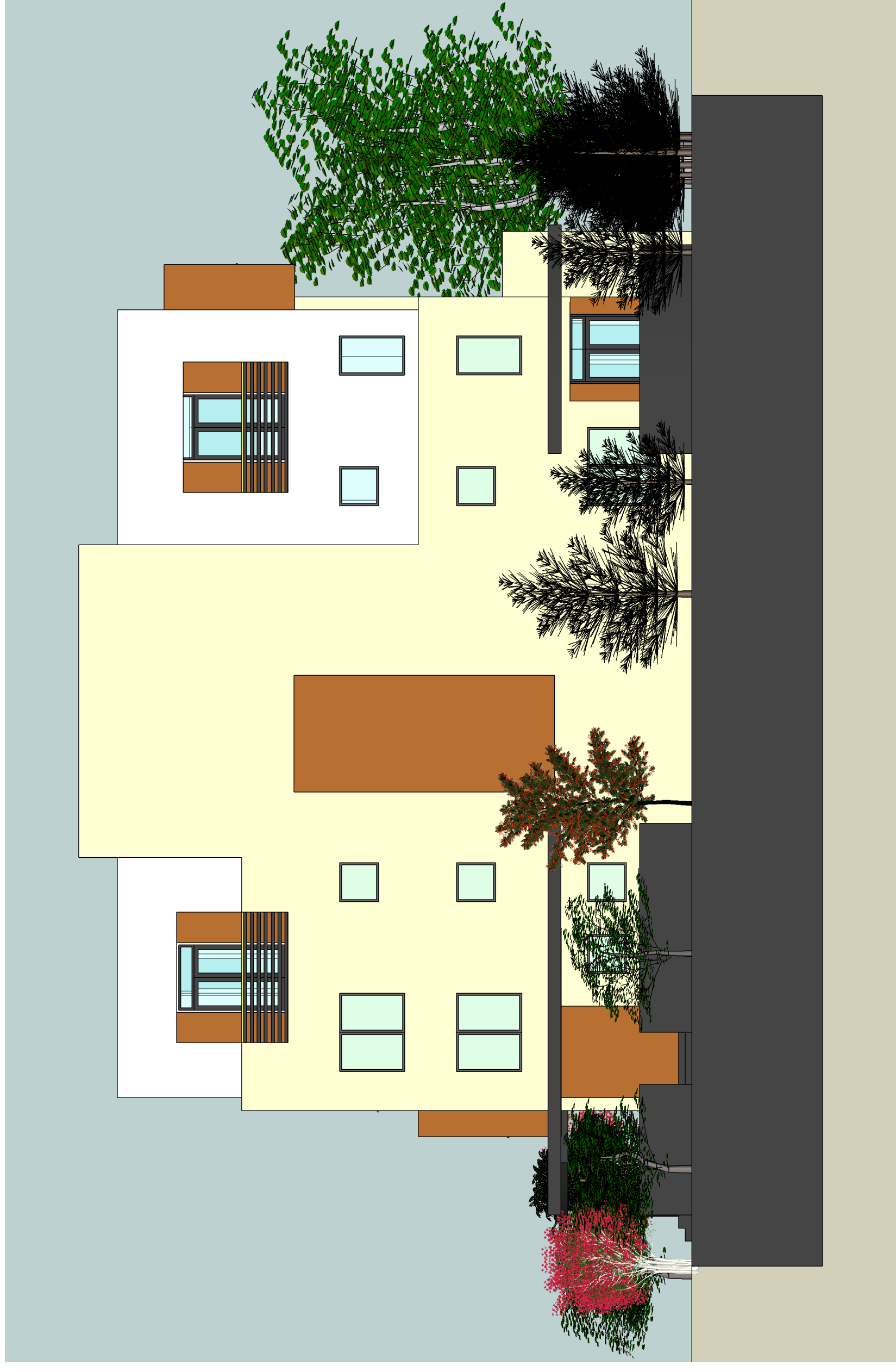
NORTH ELEVATION Scale: 1/8" = 1'